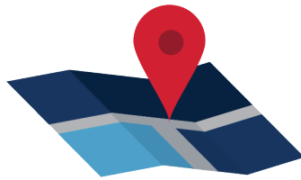
PROOF OF ADDRESS